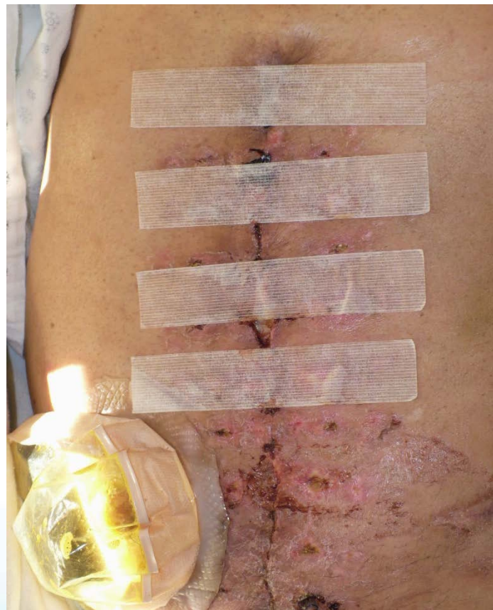
ABRA Closure Day 9